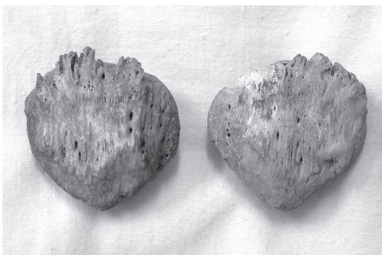
Figure 2. Bilateral enthesopathy of calcanei (grave 2126).

Concerning localisation, the lesions occurred in calcanei the most frequently (238 cases; Fig. 1), the alterations in the patellas could be seen more rarely: 3 unilateral and 18 bilateral cases were found (Fig. 2). In six male skeletons the bony outgrowths of the two sites appeared together. In another case the calcaneus and the ischial tuberosity were also affected. The lesions appeared in the tibia and in the femur together, in 3 skeletons the femoral changes could be seen mainly on the posterior surface. In another two cases, joint appearance of enthesopathies were observed. In the first case the femoral shaft and the ischial tuberosity, while in the second case, the